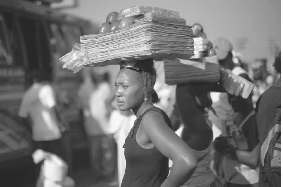
A woman carries apples and cookies for sale on a street in downtown Port-au-Prince, Haiti.

plastic chairs. A common breakfast sandwich is fried egg with slices of tomato and hot sauce.